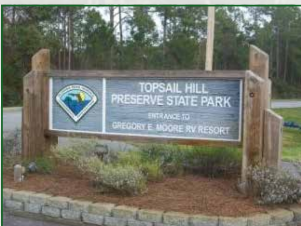
Topsail Hill Preserve State Park

Click Here For Our Exciting State Park Events