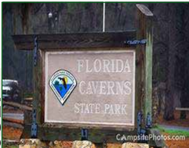
Florida Caverns State Park