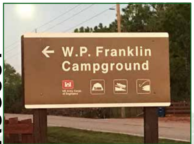
W.P. Franklin Campground